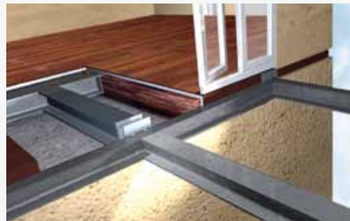
Steel-to-steel connection: Isokorb® Type KST.