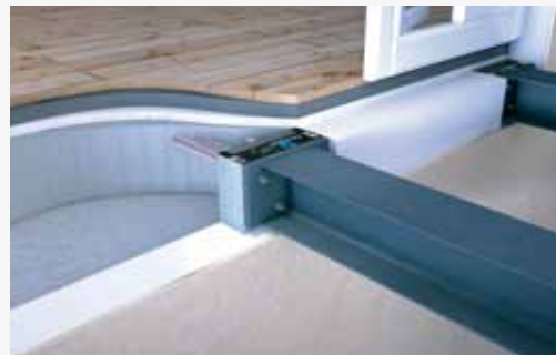
Steel-to-reinforced concrete connection: Isokorb® Type RKS.